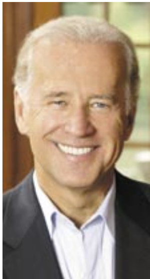
Sen. Joe Biden

In Chinese face reading, the left side of the face is said to show someone's more private self, and the right side, the public self. Here we have someone with a much brighter, friendlier expression on his public side. This isn't a surprise. You'd expect a politician to show a very friendly face publicly; it convinces us that he does want make a real connection with us.