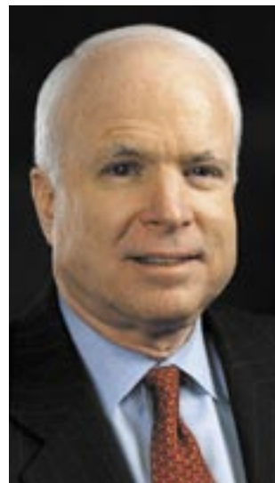
Sen. John McCain

So we turn to the left side to see what's also going on privately. On many people, if you look only at the left side of their face, you often see a sad face or even a very negative expression. But here we see a really grounded, authentic expression. Certainly you can see touches of the grief he's experienced in his life. But there is still a genuine warmth. Biden's private self is in balance and encourages trust.