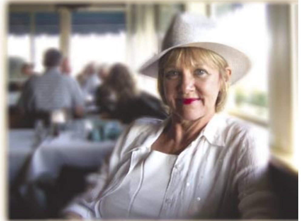
Penney Peirce says that when you clear the clutter in your subconscious, you get into your home frequency and you'll have a whole new perspective on how life works.

A lot of fear comes in and people want to suppress what is coming out of the subconscious. Fear relates to the adrenal flight-or-fight response. We might try to overwhelm, dominate, be