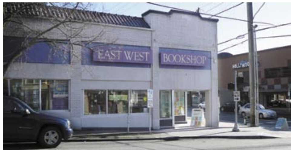
East West Bookshop has been like a second home to many spiritual seekers in its 20-year history. After two moves to increasingly larger spaces, East West is now located at 65th and Roosevelt in Seattle.

Susan: Sometimes people ask for help that